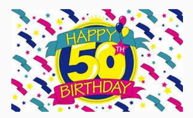
CHUF's Special Anniversary

https://www.valelottery.co.uk/support/chearsley-haddenham-under-fives-pre-school